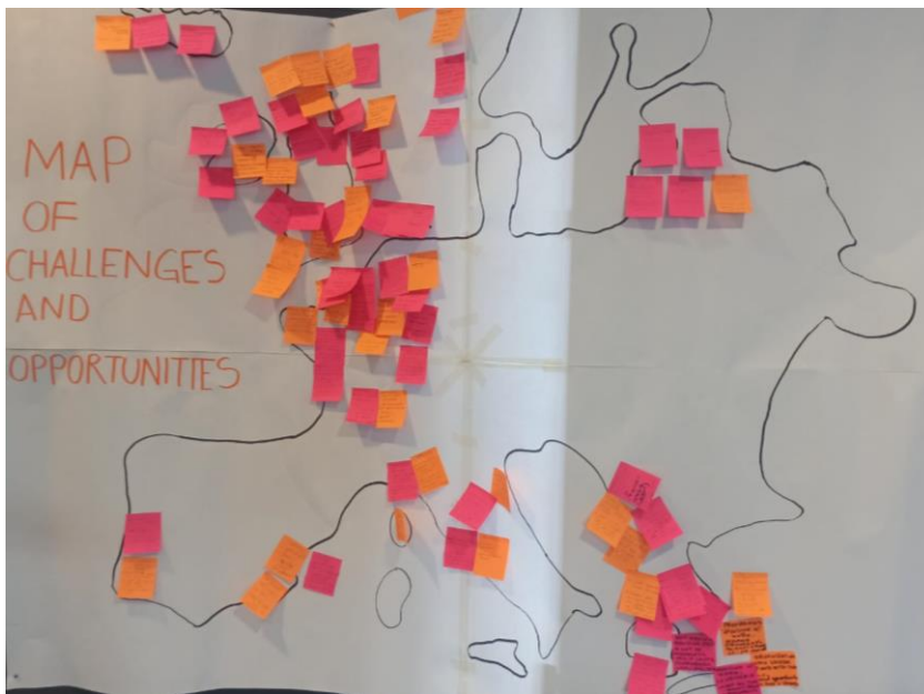
Figure 1: Map of Challenges and opportunities. This image shows the outcome of the activity. The pink post-it represents the challenges and the orange the opportunities of their local context in relation to youth homelessness. Self-made photo, 3 October 2022.