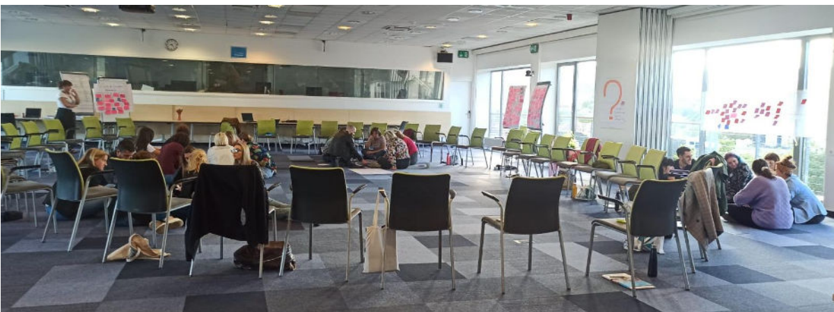
Figure 2: Working in groups Diamond Ranking activity. This image shows participants working in groups during de Diamond Ranking activity. Self-made photo, 3 October 2022.

Social workers typically receive little training on human rights and during the training participants explored the intersectionality of rights in order to view their work not just as social services, but as human rights protectors.